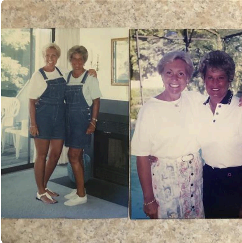
Me and my best buddy